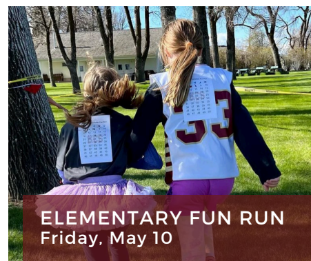
ELEMENTARY FUN RUN Friday, May 10