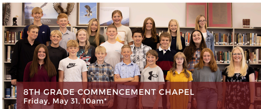
8TH GRADE COMMENCEMENT CHAPEL Friday, May 31, 10am*