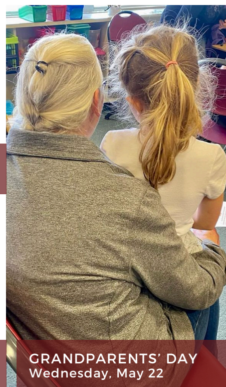
GRANDPARENTS' DAY Wednesday, May 22