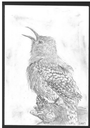
Eden Forsythe (9th)