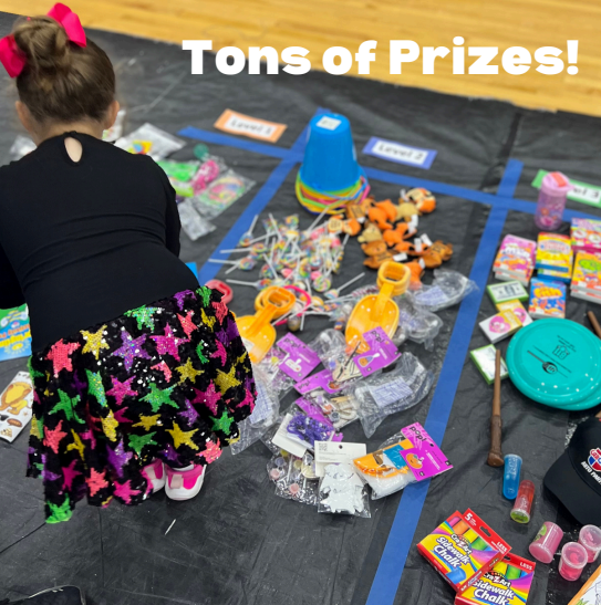
Tons of Prizes!