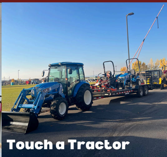
Touch a Tractor